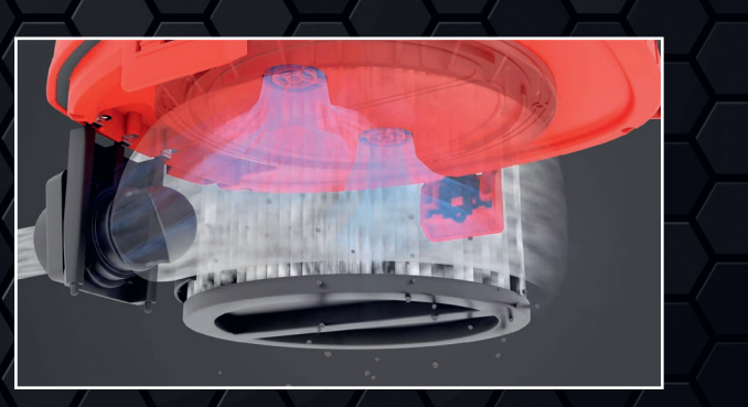
It consists of two independent filter chambers, which are cleaned one after the other. Suction current and suction power thus remain at a consistently high level even during cleaning, which guarantees permanent suction.