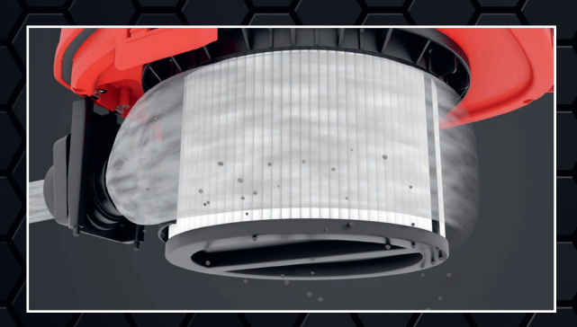
Dealing with hazardous dusts requires innovative product developments. The heart of the CraftiX is the patented HEPA 13 (dust class L, M) or HEPA 14 (dust class H) cartridge filter.